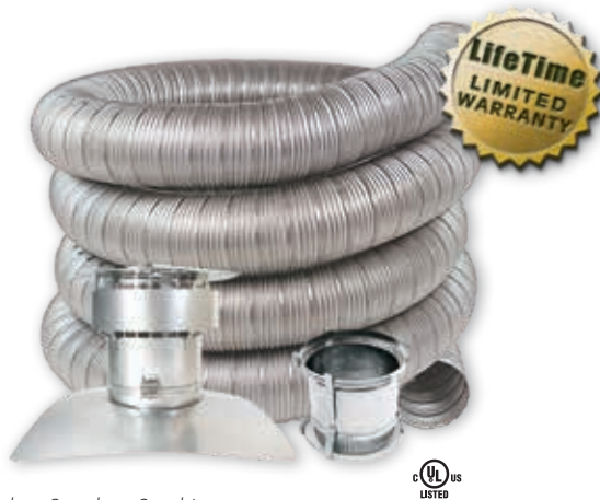
Kit includes: Stainless Steel Liner, ZMax Cap and Flashing Insert Adaptor