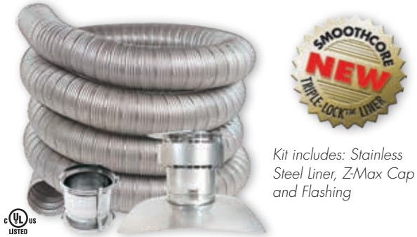
Kit includes: Stainless Steel Liner, ZMax Cap and Flashing